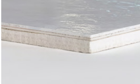
Glasbord® with Surfaseal® laminated on Rigid Board (Hygimat)