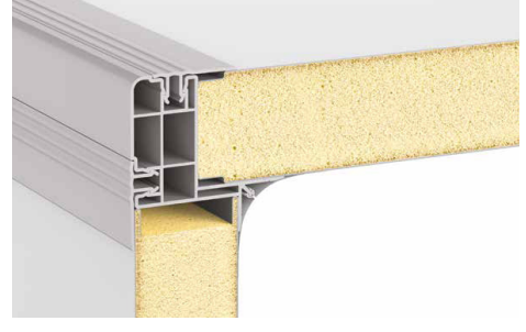
Glasbord® with Surfaseal® Modular Panels (Hygicold)